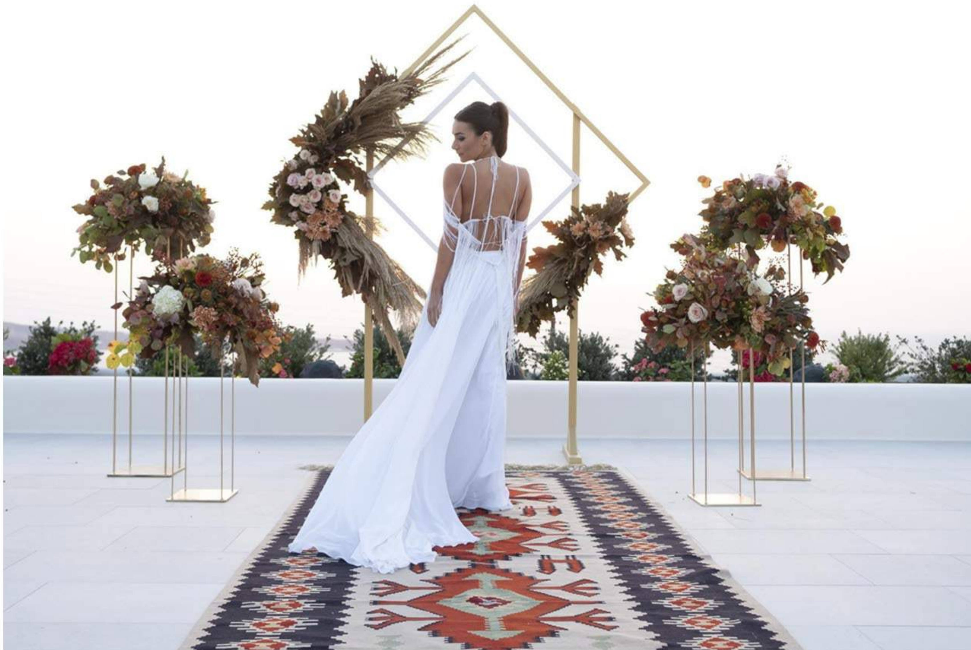
Fairytale Weddings in Santorini