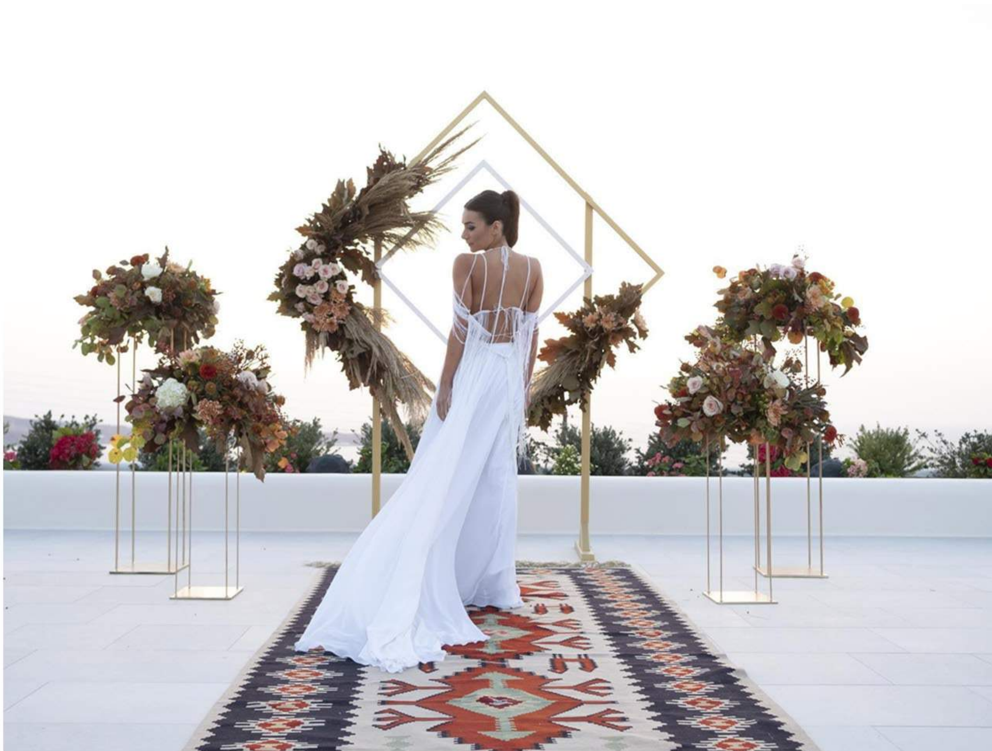
Fairytale Weddings in Santorini