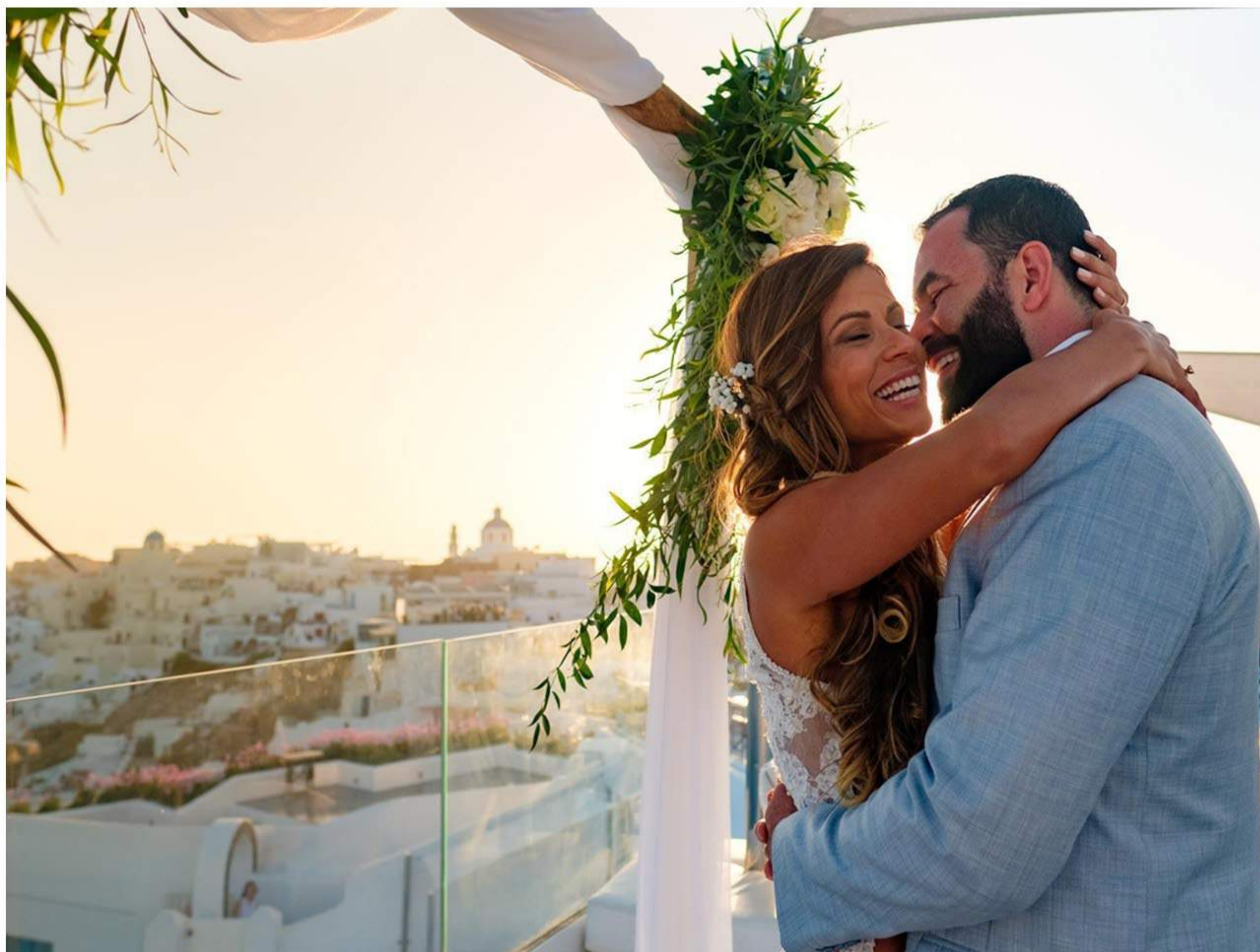
Fairytale Weddings in Santorini